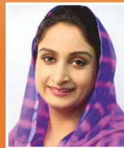
Harsimrat Kaur Badal Minister of Food Processing Industries