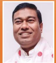
Rameswar Teli Minister of State, Food Processing Industries