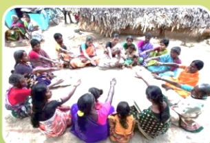
Support to FPOs/ SHGs/ Cooperatives