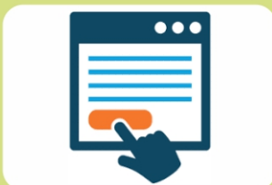
Application for the Subsidy