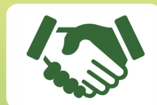
Branding & Marketing