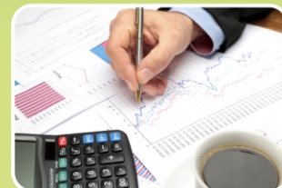
DPR and FUPs