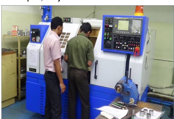
AS-9100 certified production facility at CTTC, Bhubaneswar