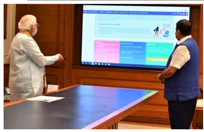
Hon'ble PM launching the Champions Portal in the presence of Hon'ble Minister MSME