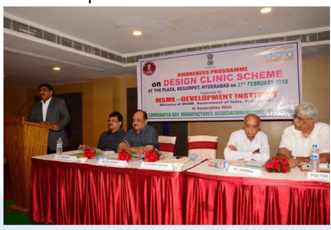
Awareness programme by MSME-DI, Hyderabad