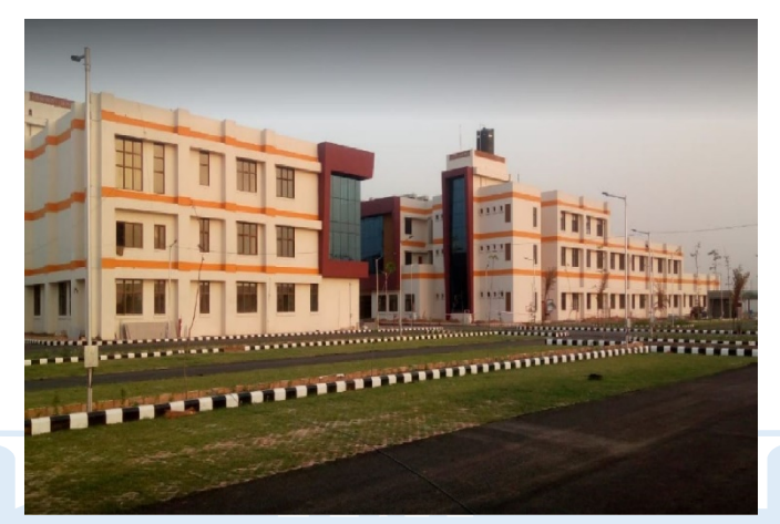
Newly constructed, MSME – TC Bhiwadi