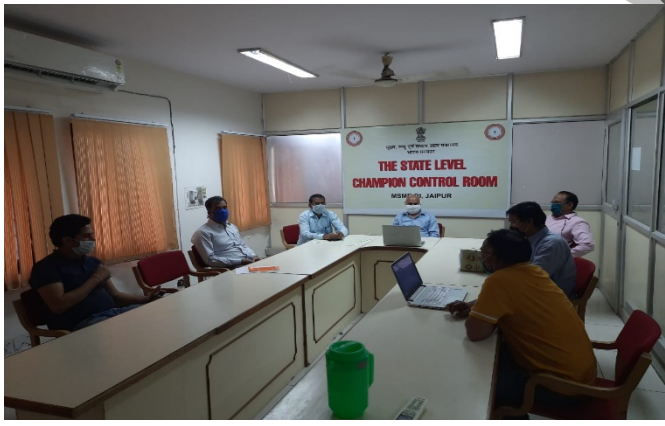
State Level Champions control room – Jaipur, Rajasthan