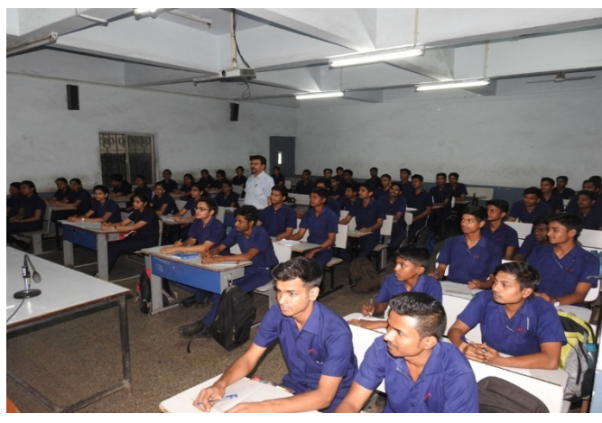
Training session being conducted at IDTR, Jamshedpur