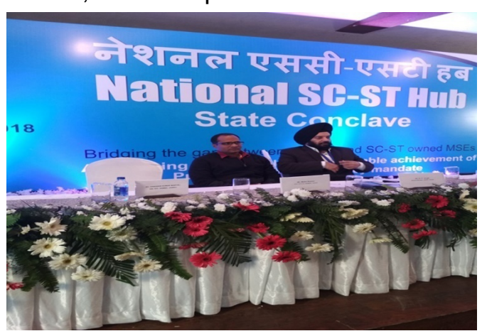
MSME-DI Jammu, J&K organizing a state conclave