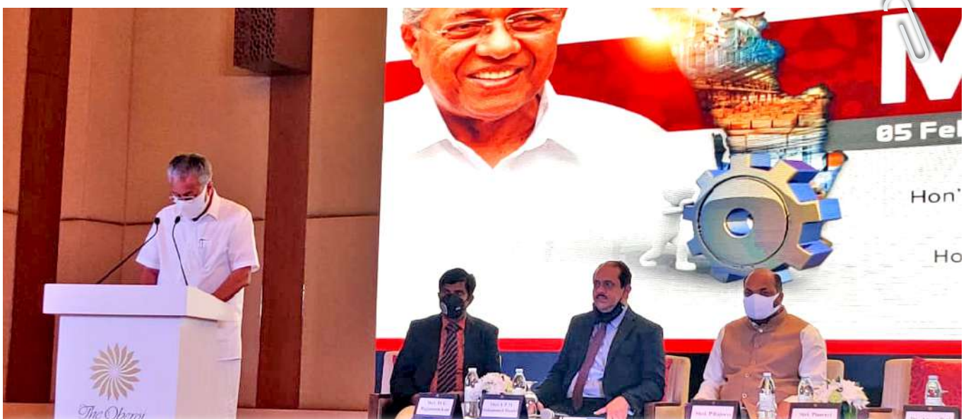
SHRI PINARAYI VIJAYAN, HON'BLE CHIEF MINISTER SPEAKING TO INVESTORS AT THE EXCLUSIVE KERALA INVESTORS MEET, ORGANISED ON THE SECOND DAY OF KERALA WEEK. HE HIGHLIGHTED THE VARIOUS OPPORTUNITIES THAT THE STATE HAS TO OFFER ACROSS VARIOUS SECTORS OF THE STATE.