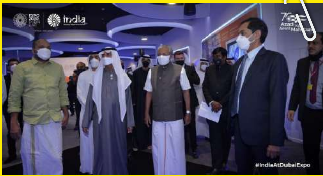
KEY DIGNITARIES ARRIVE AT THE KERALA STATE FLOOR OF INDIA PAVILION ON 4TH FEBRUARY 2022.