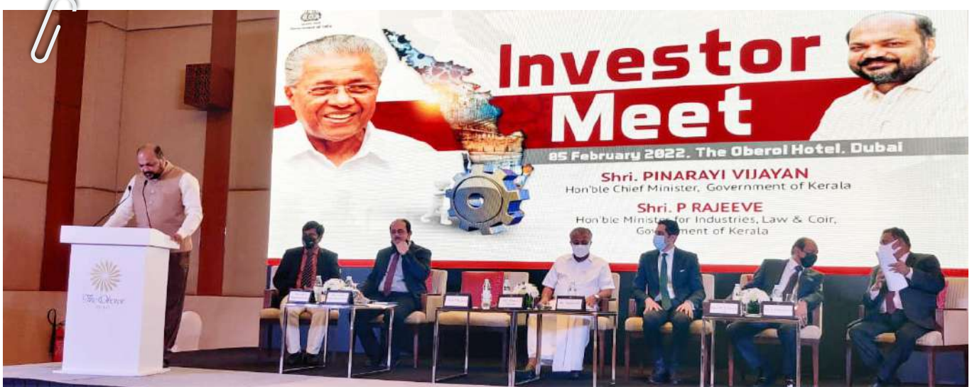
DURING THE INVESTORS MEET, SHRI P RAJEEV, HON'BLE MINISTER FOR INDUSTRIES, LAW & COIR, SHARED GLIMPSES OF THE INVESTMENT CLIMATE IN THE STATE AND THE NEW REFORMS LAUNCHED BY THE DEPARTMENT TO FACILITATE DOING BUSINESS IN THE STATE.