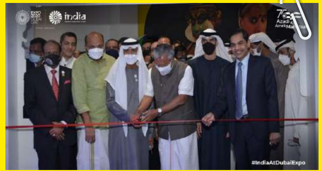
INAUGURATION OF THE KERALA STATE FLOOR BY SHRI PINARAYI VIJAYAN, HON'BLE CHIEF MINISTER AND SHRI P RAJEEV, HON'BLE MINISTER FOR INDUSTRIES, LAW & COIR, KERALA AND H.E. SUNJAY SUDHIR, AMBASSADOR OF INDIA TO THE UAE